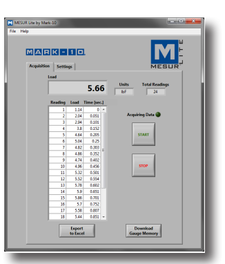
MESUR® Lite data acquisition software is included with Series 7 gauges

Series 7 gauges include all the functions of Series 5 gauges, with several additional features, including high speed continuous data capture and storage, with memory for up to 5,000 readings at an acquisition rate of up to 14,000 Hz. The gauges also feature programmable footswitch