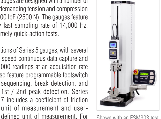
Shown with an ESM303 test stand and G1061 wedge grips

the completion of break detection, averaging, external trigger, and 1st / 2nd peak detection.