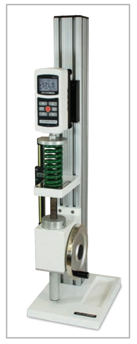
Shown with a TSF test stand in a spring testing application

with high capacity Mark-10 test stands, grips, and software.