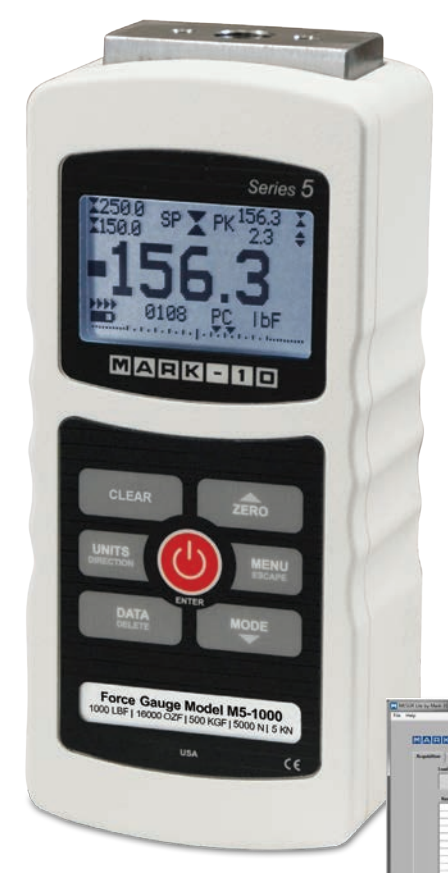
are designed for tension and compression force testing in numerous applications across virtually every industry, with capacities up to 2,000 lbF (10,000 N). The gauges features an industry-leading sampling rate of 7,000 Hz, producing accurate results even for quick-action tests. A large, backlit graphics LCD displays large, legible characters, while the simple menu navigation allows for quick access to the gauges' many features and configurable parameters. Data can be transferred via USB, RS-232, Mitutoyo (Digimatic), or analog outputs.

The M5-750, M5-1000, M5-1500, and M5-2000 advanced digital force gauges