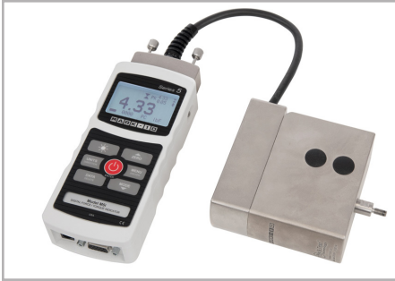
AC1083 Adapter, FS05 to Plug & Test® connector

Adapts a Series FS05 load cell to Plug & Test® type interface, for use with a Mark-10 indicator. Also allows for mounting to Models F755(S) and F1505(S). Shown above with Model M5I indicator.