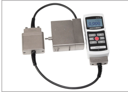
AC1084 Plug & Test® Extension cable

Adapts a Series FS05 load cell to Plug & Test® type interface, for use with a Mark-10 indicator. Also allows for mounting to Models F755(S) and F1505(S). Shown above with Model M5I indicator.