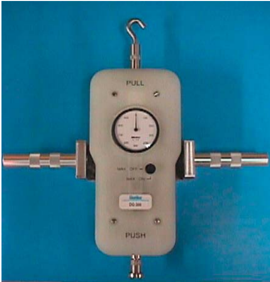
DG Series force gauge shown with optional Handle Set Assembly (p/n SPK-DG-Handle).